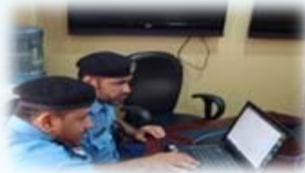
In-Service Support (ISS)