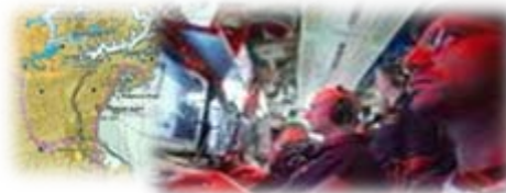
Tactical Situational Awareness Solutions