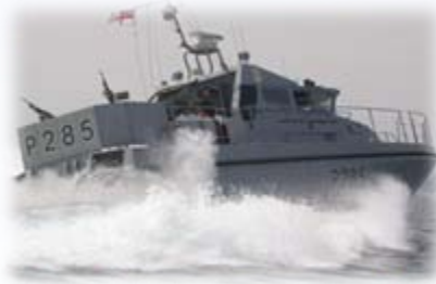
Integrated Navigation & Tactical Systems (INTS)