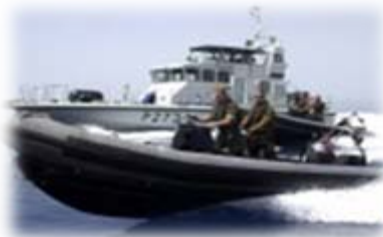
Tactical - Asset Control & Tracking (T-ACT)