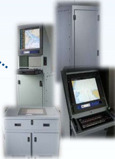
Software & Hardware Solutions