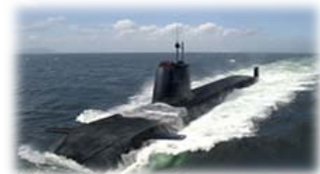
Submarine Navigation Solutions (ECPINS-W/S)