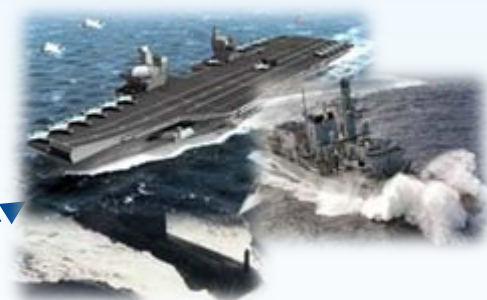
Warship Navigation Solutions (ECPINS-W)