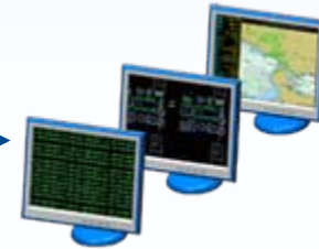
Systems Integration to Sensors & Combat Management Systems